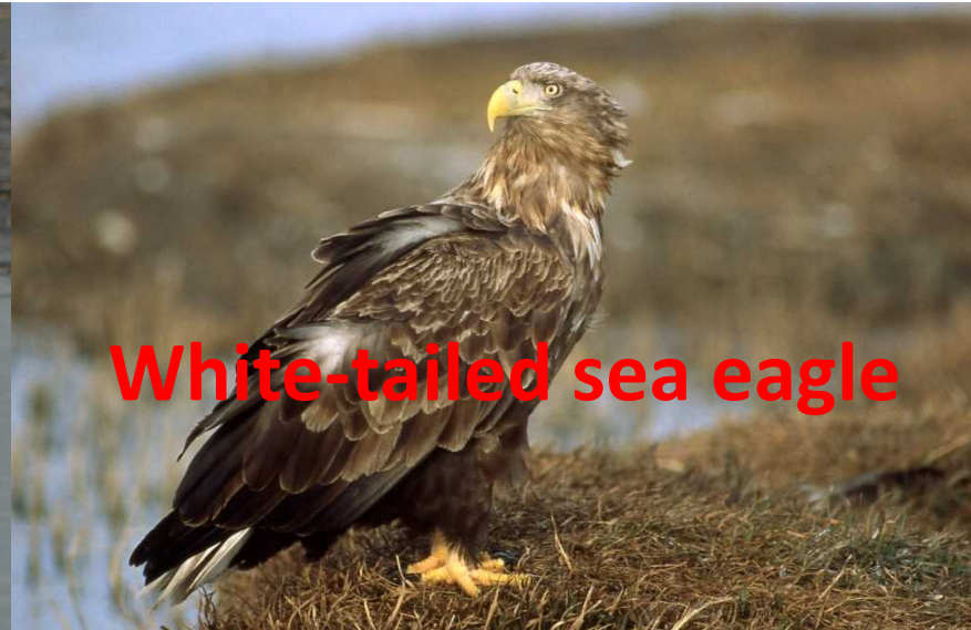
White-tailed sea eagle