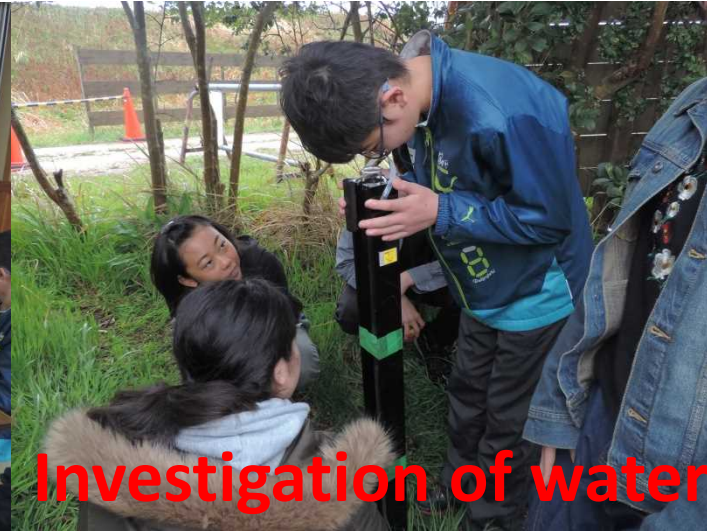
Investigation of water