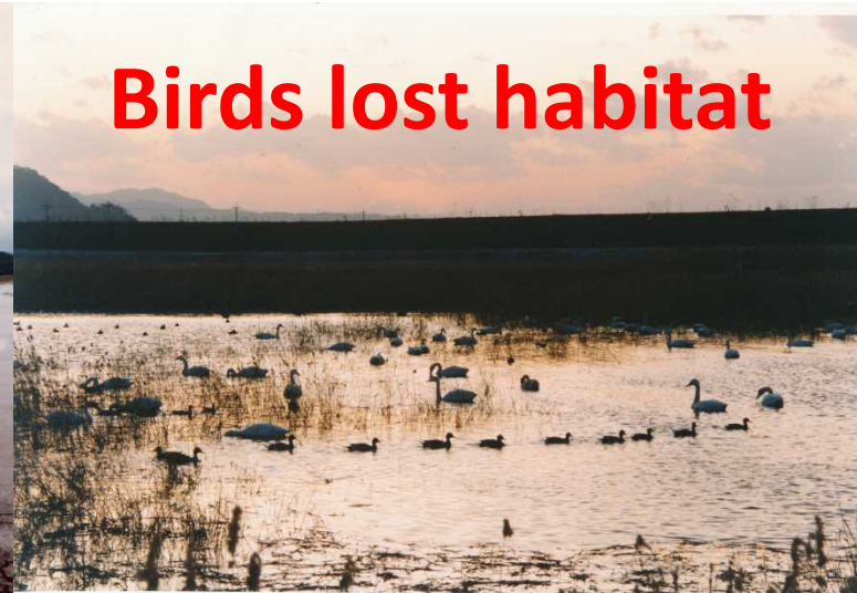
Birds lost habitat