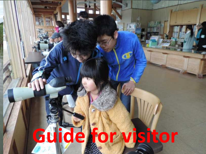
Guide for visitor