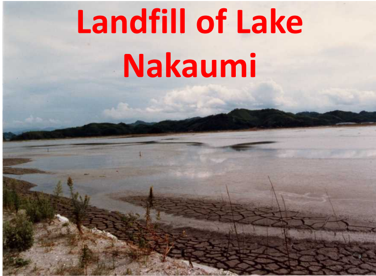
Landfill of Lake Nakaumi