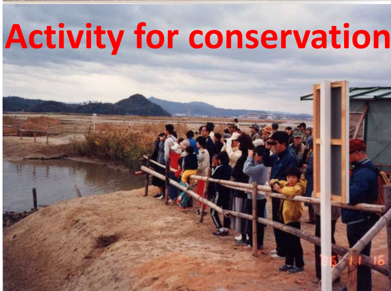
Activity for conservation