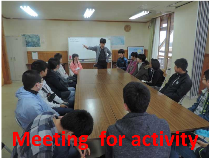
Meeting for activity