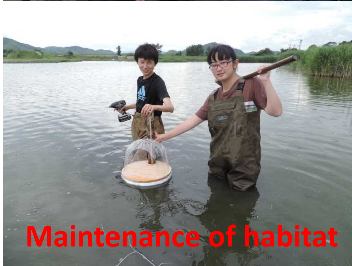
Maintenance of habitat